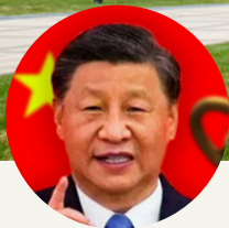
PRESIDENT XI JINPING