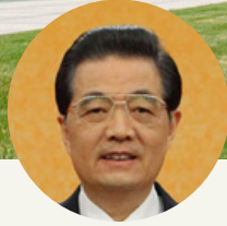
FORMER PRESIDENT HU JINTAO