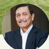
HON. PROFESSOR LUHUT BINSAR PANDJAITAN